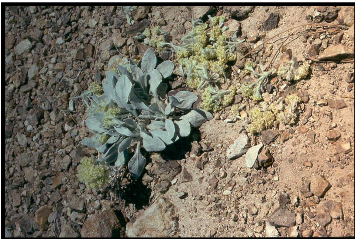
Figure 10. Eriogonum robustum with flowering stems clipped, possibly by an herbivore, at site 50 on 10 June 1994.