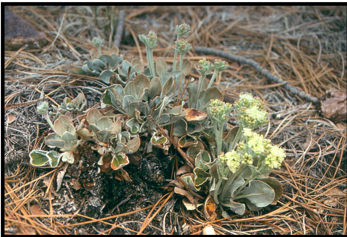
Figure 8. Eriogonum robustum in bud and early flower, in litter of Pinus ponderosa at site 35 on 26 May 1994.