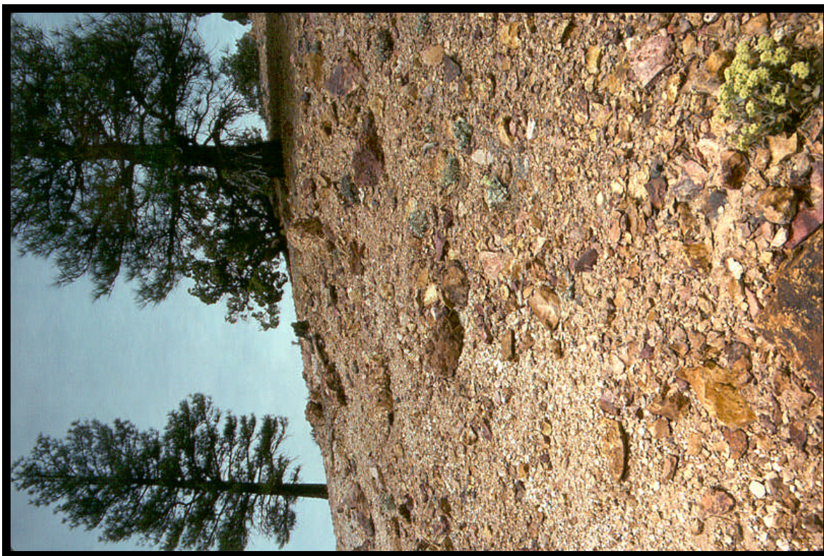
Figure 9. Eriogonum robustum habitat in good condition at site 109 on 1 June 1994.