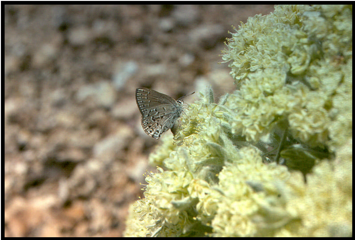
Figure 5. Butterfly visiting flowers of Eriogonum robustum at site 50 on 10 June 1994.