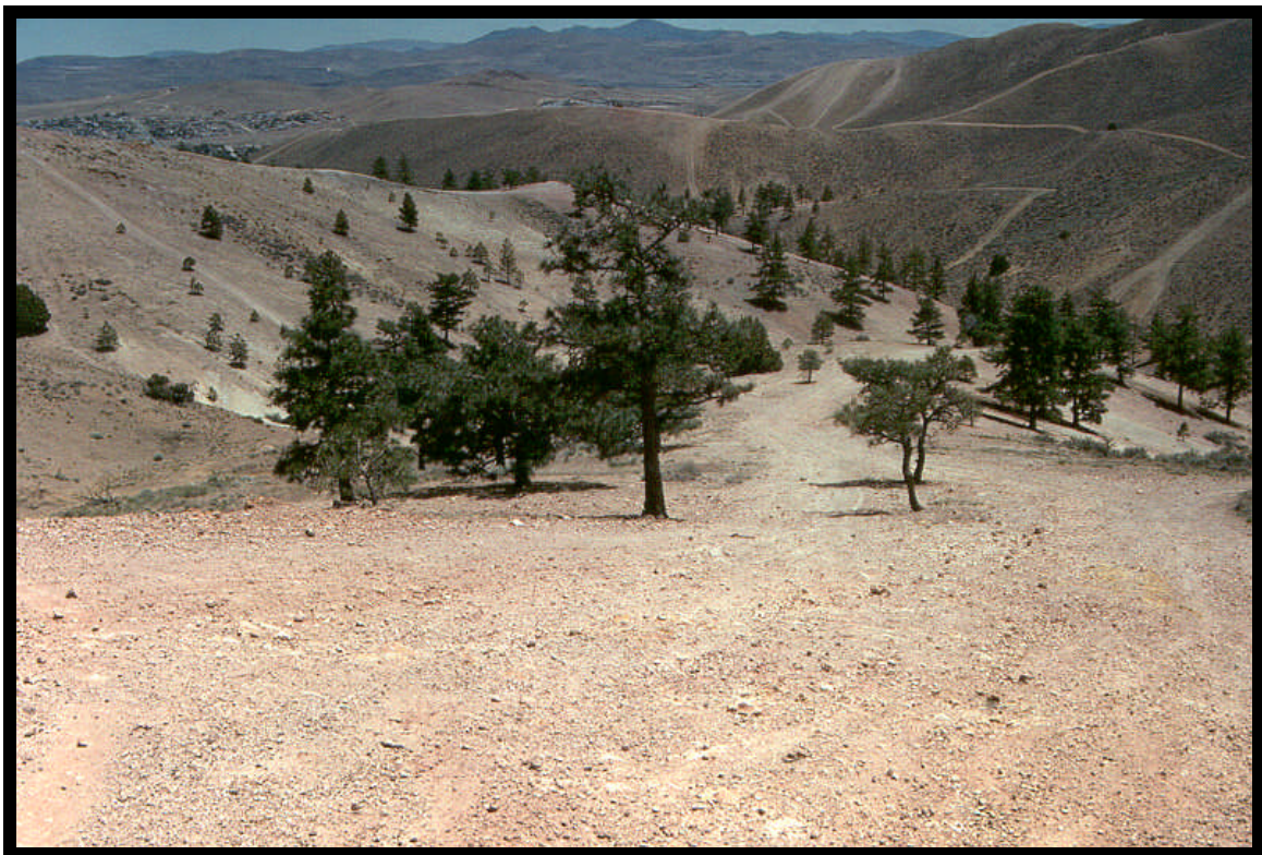
Figure 6. Eriogonum robustum habitat at site 50 showing damage from off-road vehicle activity on 10 June 1994. View to the east-southeast toward Sun Valley, with site 47 in the middle ground and site 46 in the background.