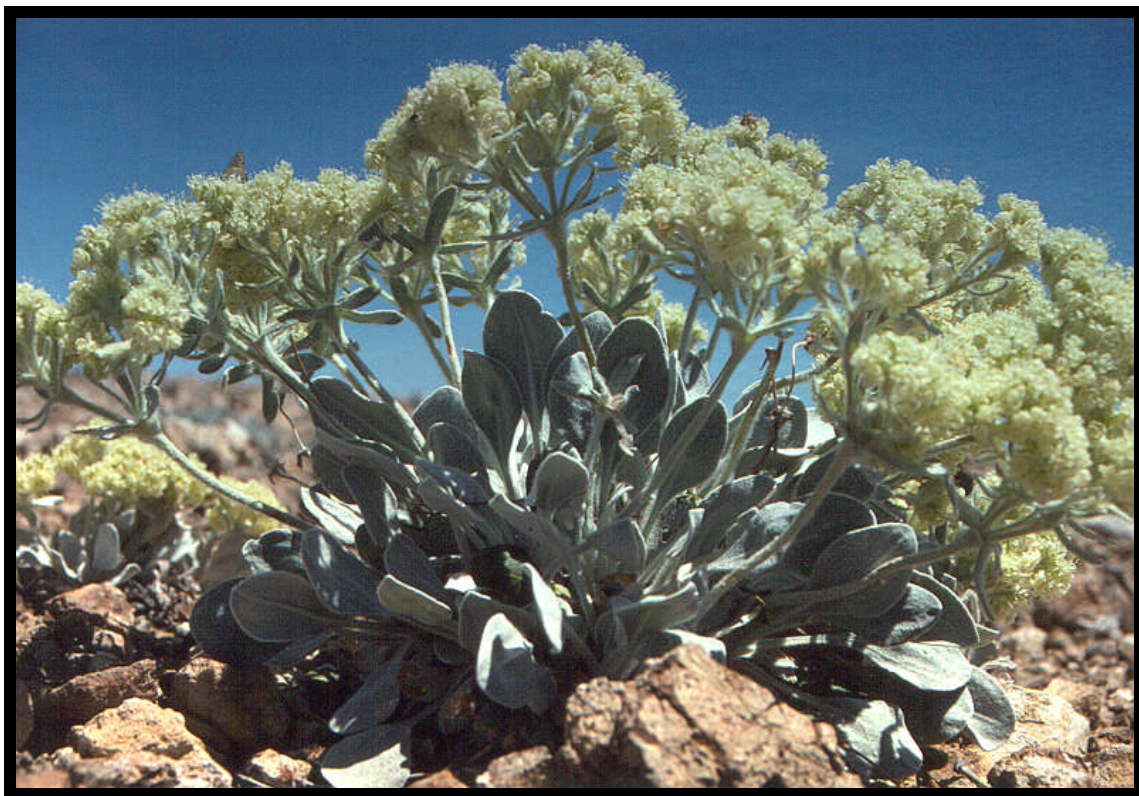
Figure 3. Eriogonum robustum at site 50, in full flower on 10 June 1994. See Appendix 1 tables for site descriptions.