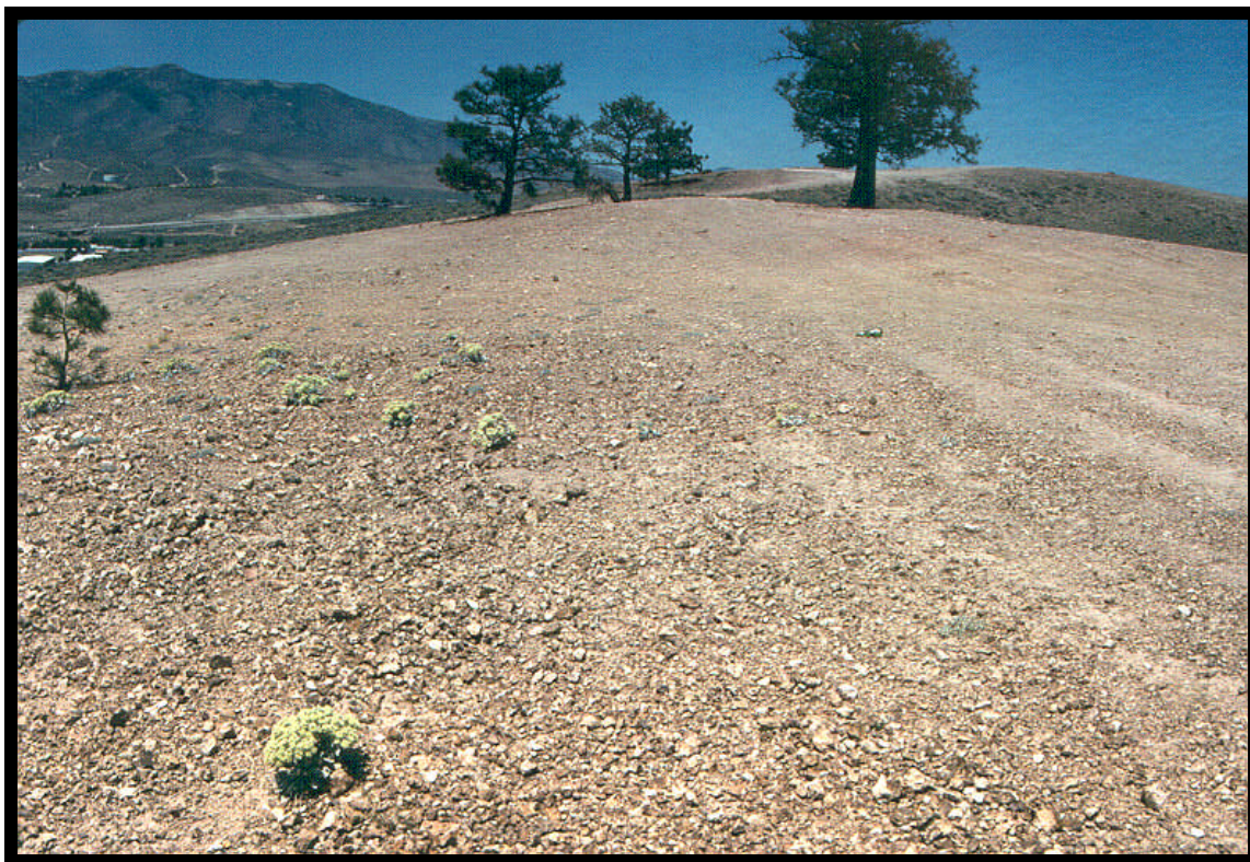
Figure 7. Close-up of off-road vehicle damage in Eriogonum robustum habitat at site 50 on 10 June 1994. View to the west-northwest, Peavine Mountain at left.