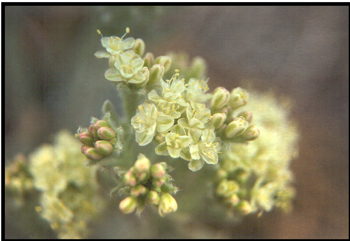
Figure 4. Close-up of Eriogonum robustum in bud and early flower at site 35 on 26 May 1994.