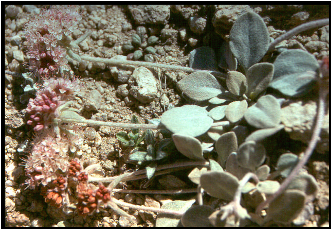
Figure 12. Eriogonum lobbii flowers, same location as Figure 11.