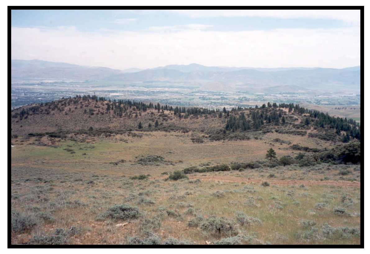
Figure 8. Overlooking Ivcsia webberi Site 6. The population is on the sparsely vegetated flat before the ridge. Note Reno in the background, 11 June 1997.