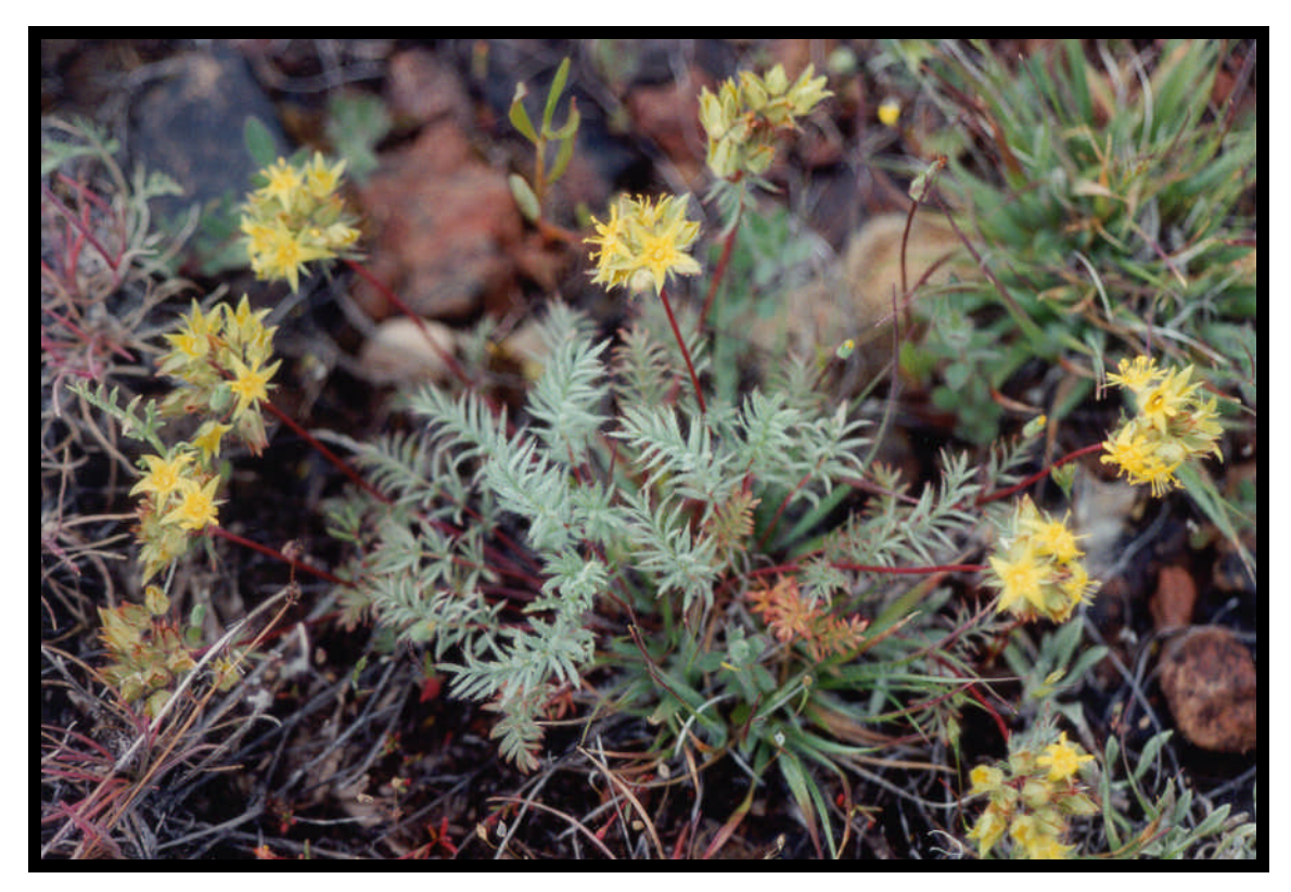
Figure 2. Ivesia webberi at site CA3, in full flower on 2 June 1998. See Appendix 1 tables for site description.