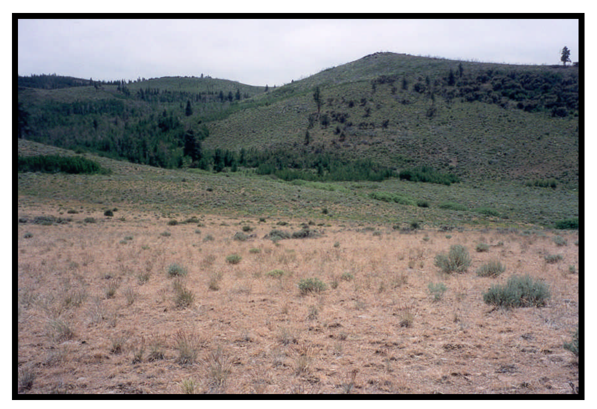
Figure 6. View looking southeast from the edge of Ivesia webberi Site 4. The grassy area in the foreground is the population, 2 June 1997.