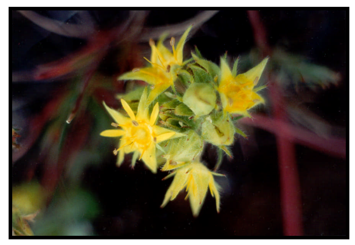
Figure 3. Single head of Ivesia webberi from plant shown in Figure 1, 2 June 1998.