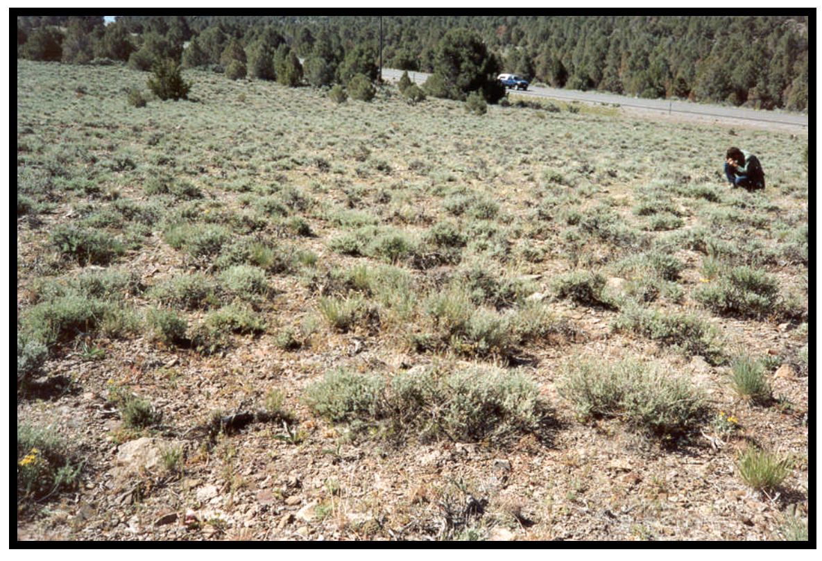
Figure 9. Ivesia webberi Site 7 in Douglas County is the southern-most in this species's range. Note Highway 395 in the background, 10 June 1997.

Figure 8. Overlooking Ivcsia webberi Site 6. The population is on the sparsely vegetated flat before the ridge. Note Reno in the background, 11 June 1997.