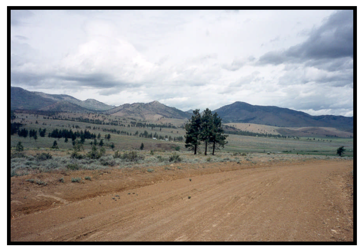
Figure 4. View to the northwest from the upper edge of Ivesia webberi Site 1. Note the recent blading of the road through this privately owned parcel, 3 June 1997.