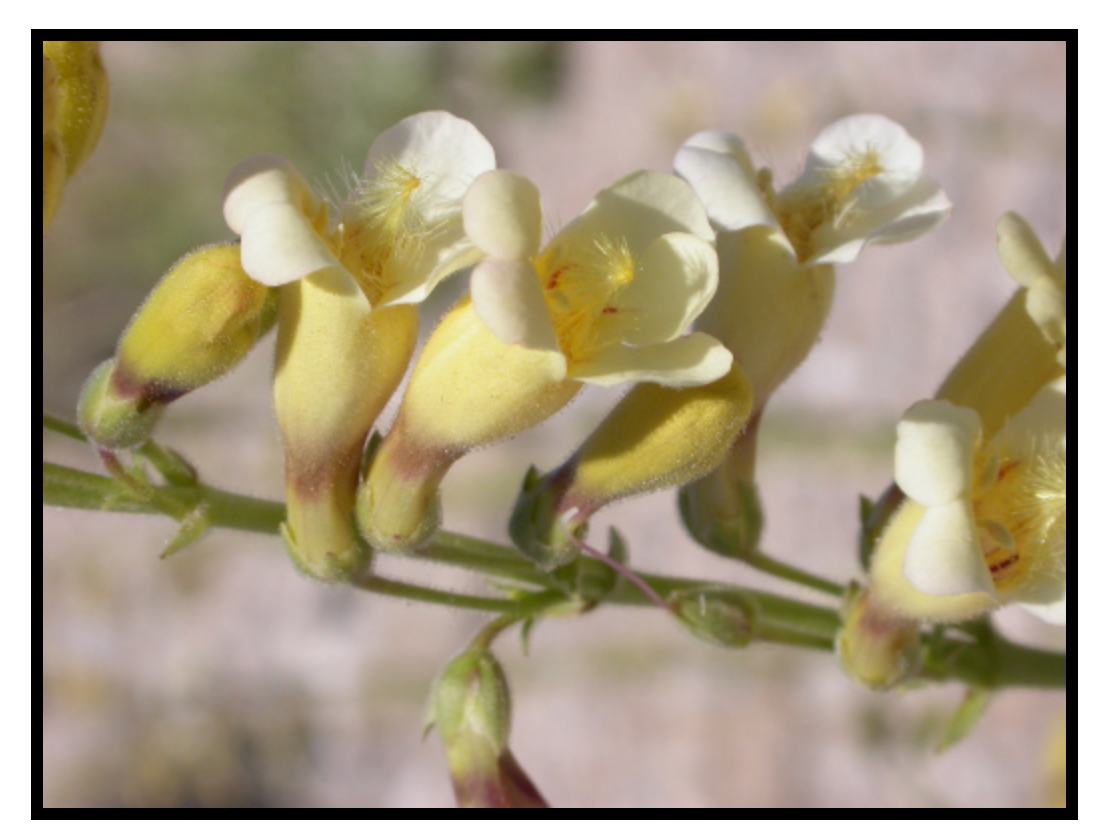
Figure 2. Close-up of flowers of Penstemon bicolor (yellow phase).