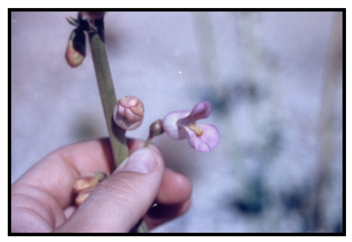
Figure 13. A hybrid between Penstemon bicolor and Penstemon palmeri near Jean.