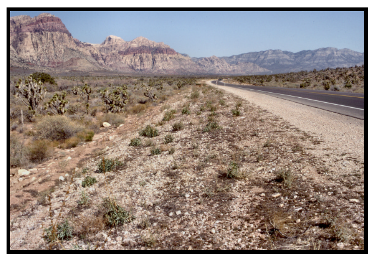
Figure 5. Habitat of Penstemon bicolor along Highway 32 in Red Rock Canyon National Recreation Area.