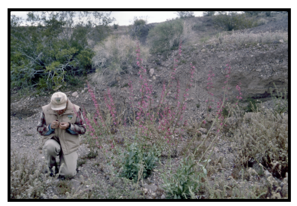
Figure 6. Growth form of Penstemon bicolor (rose phase) near the town of Nelson.