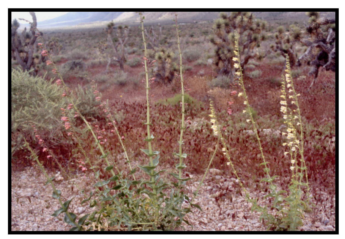
Figure 8. The yellow and rose phases of growing together along Highway 32 in Red Rock Canyon National Recreation Area.