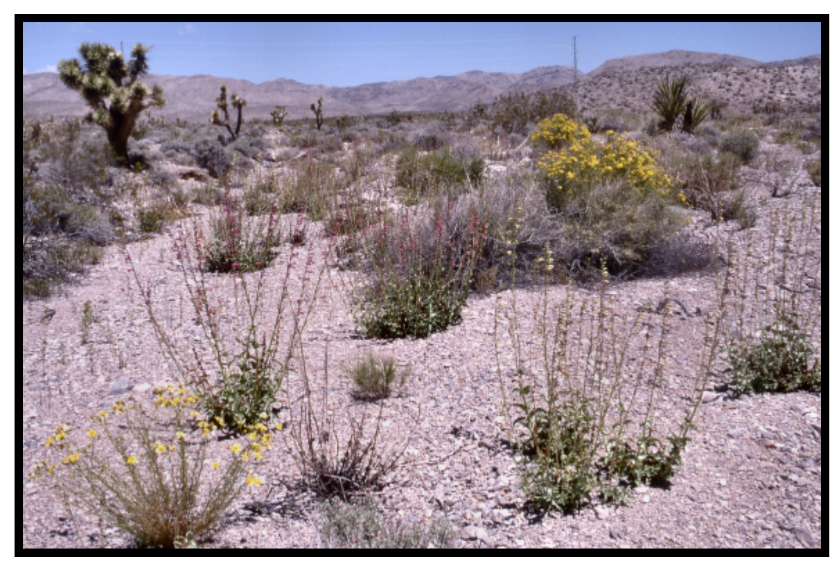
Figure 11. Penstemon bicolor showing various flower colors between Jean and Goodsprings.