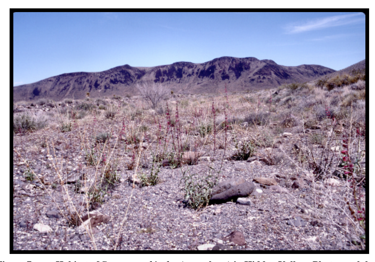
Figure 7. Habitat of Penstemon bicolor (rose phase) in Hidden Valley.