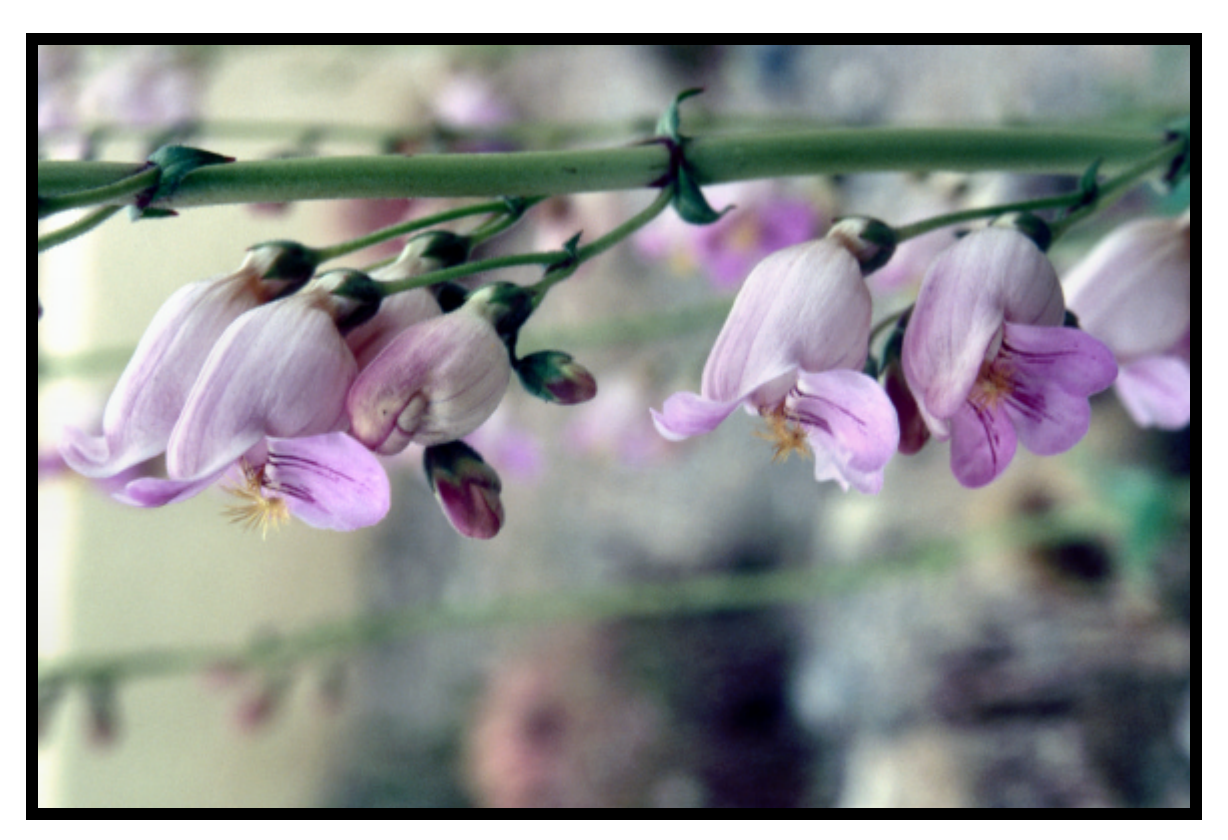
Figure 12. Close-up of flowers of Penstemon palmeri .