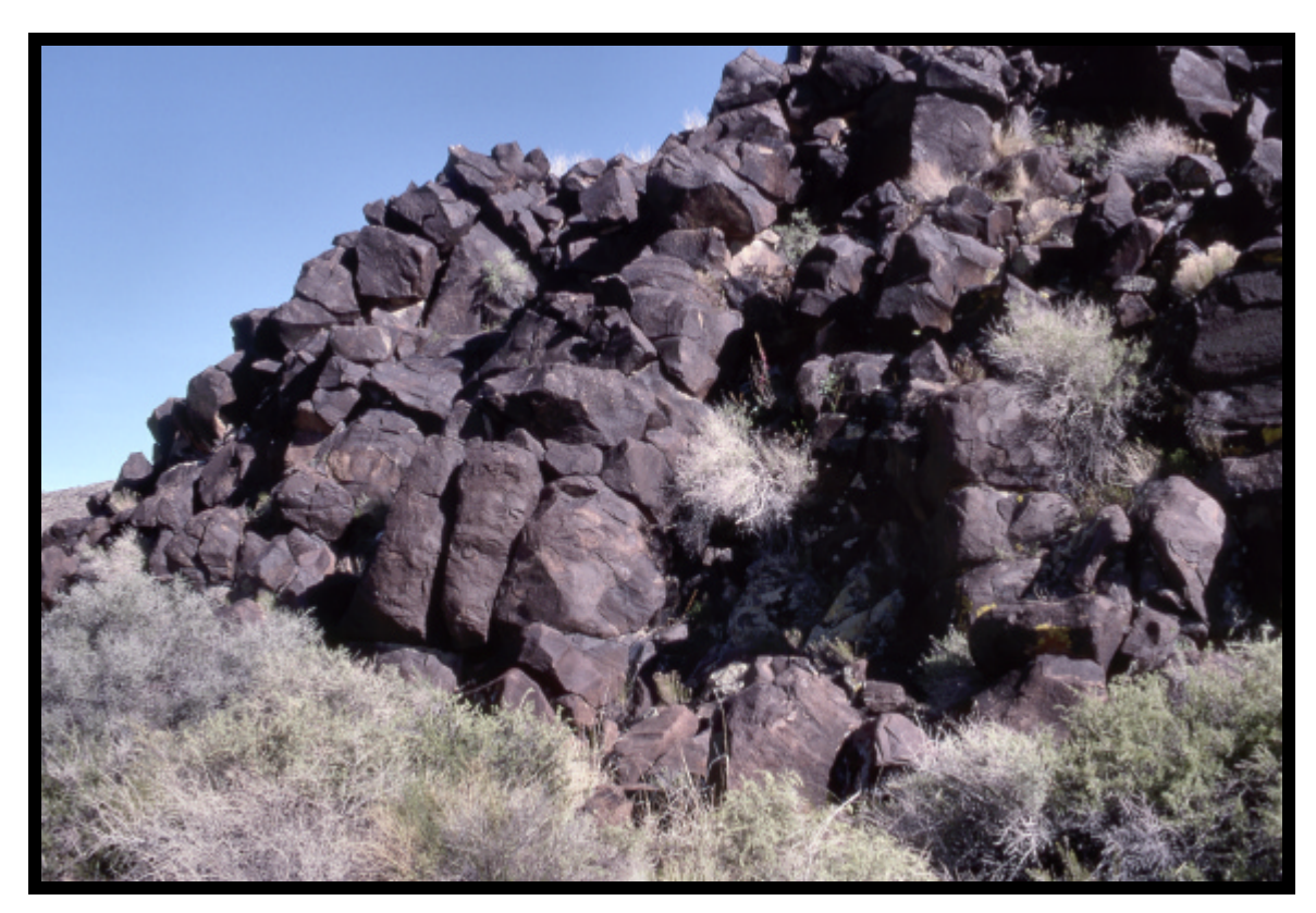
Figure 10. Habitat of Penstemon bicolor (rose phase) in rocks north of Hidden Valley.