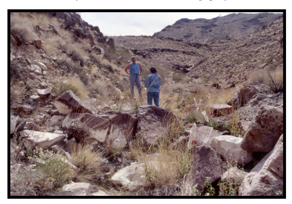
Figure 9. Habitat of Penstemon bicolor (rose phase) in the McCullough Mountains.