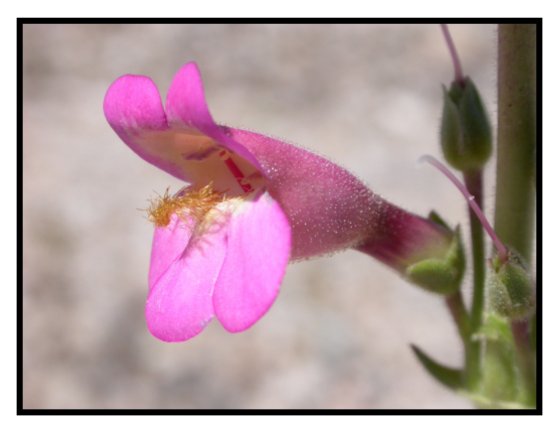
Figure 3. Close-up of flowers of Penstemon bicolor (rose phase).